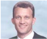
Newspaper Columnist Regional Manager, US Credit Academy