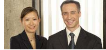
** Coming Soon **

Check Out Our Rating With The BBB Click Here & Enter "VR-Tech" Under the Check Out A Business or Charity Tab.